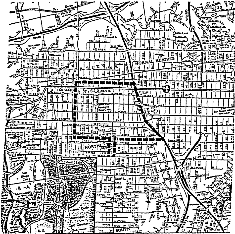
■■■■■■■■■■ Proposed North Park Redevelopment Survey Area