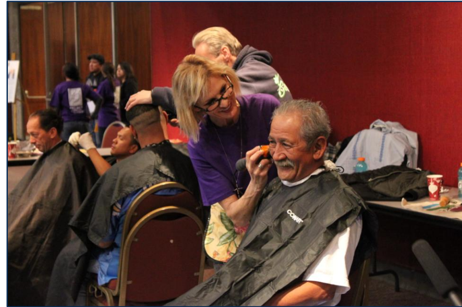
Project Homeless Connect 300 haircuts provided by volunteers January 5, 2011

For the second year, the San Diego Housing Commission is the lead organizer for Project Homeless Connect, partnering with Family Health Centers of San Diego, St. Vincent de Paul Village, the Interfaith Shelter Network and other community organizations.