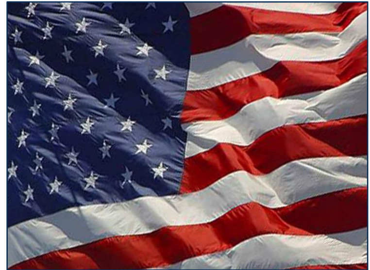
VASH program was created on December 26, 2007 by the federal government