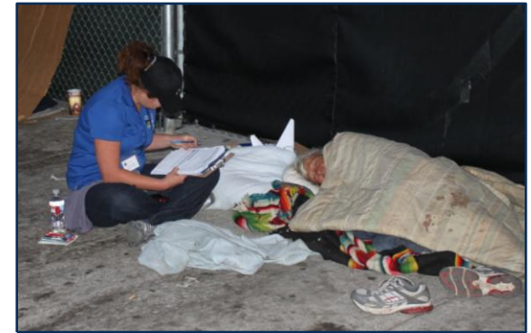
National Registry Week September 19 – 23, 2010 1,040 homeless individual living on the streets were counted

Spearheaded by the Downtown San Diego Partnership and Centre City Development Corporation