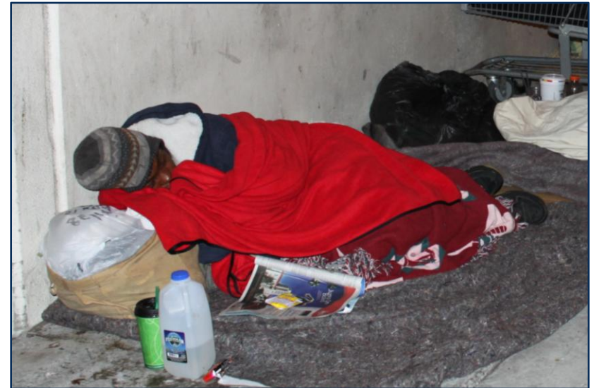
Clients must remain in the program for 30 days