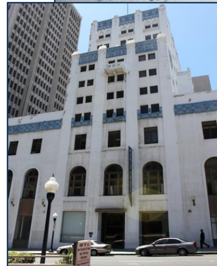
Connections Housing Downtown One-Stop Center

SDHC organized the volunteer selection site committee