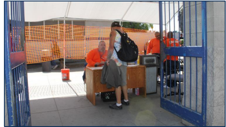
Neil Good Day Center