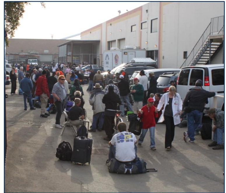
Emergency Winter Shelter for Adults December 2, 2010 – April 4, 2011