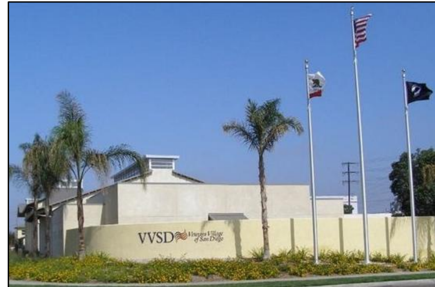
Veterans Village of San Diego