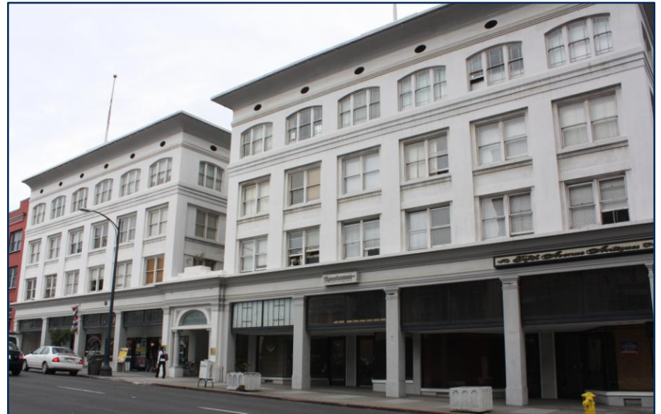
Sandford Hotel 129 units to be completed March 2012