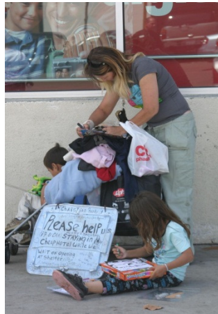
Legal Referral & Advocacy Clinic