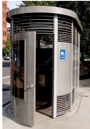
Advocacy for Portland Loos