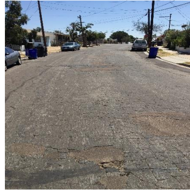
Sawtelle Ave OCI 40

Poor - A street in poor condition has severe cracking, numerous areas of failed pavement with possible sub-base failure, exhibits a rough ride, and requires a comprehensive repair or a total reconstruction. It has an OCI rating between 0 and 39. Examples of streets in poor condition are shown below: