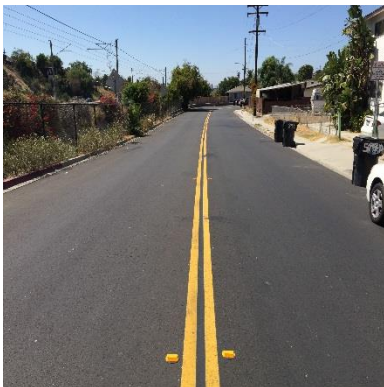
Akins Ave OCI 100

Good – A street in good condition has little or no cracking, no potholes, or other distresses; has excellent drivability; and needs little maintenance or remedial repair. It has an OCI rating between 70 and 100. Examples of streets in good condition are shown below: