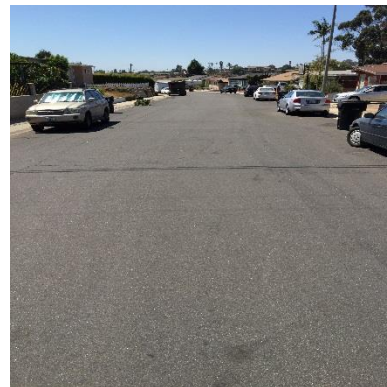
North Thorn St OCI 70

Fair – A street in fair condition has moderate cracking, some minor potholes, has adequate drivability, and is typically in need of remedial repairs and a slurry seal, or a minor area