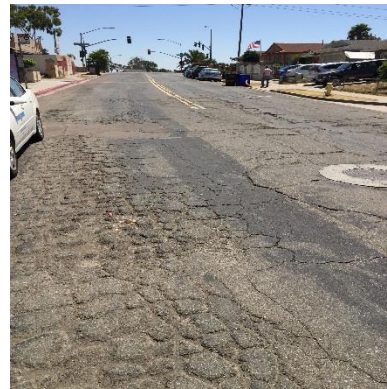
Deep Dell Rd OCI 0

To ensure quality data, City staff reviewed the data provided by Cartegraph Systems, Inc. at multiple submittals to validate the information. Cartegraph Systems, Inc. also hired an independent, specialized engineering firm to perform quality control.