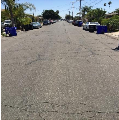
Jacumba St OCI 50

repairs. It has an OCI rating between 40 and 69. Examples of streets in fair condition are shown below: