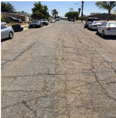
Bonsall St OCI 30

Poor - A street in poor condition has severe cracking, numerous areas of failed pavement with possible sub-base failure, exhibits a rough ride, and requires a comprehensive repair or a total reconstruction. It has an OCI rating between 0 and 39. Examples of streets in poor condition are shown below: