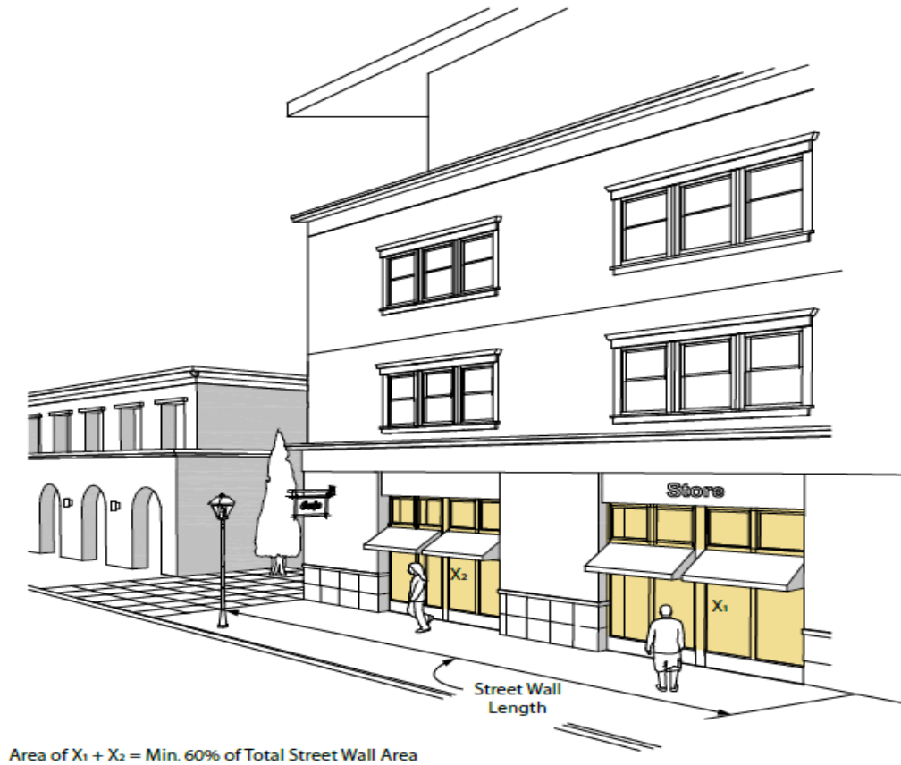
Diagram 131-07A Transparency Requirement for Non-Residential Uses

(“Building Frontage Activation, Articulation and Transparency” added 9-12-2019 by O-21118 N.S.; effective 10-12-2019.)