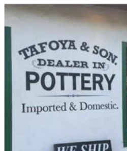
•Painted directly on