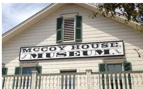
•Direct attachment to a building or canopy structure