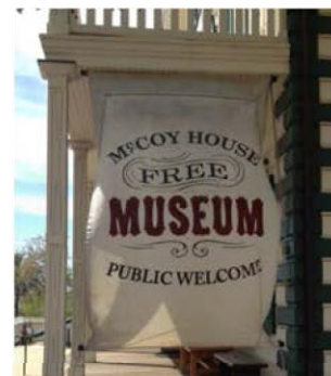
•Canvas or sailcloth