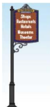
•Mounted on cast iron or cast metal post