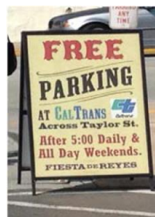
•Sidewalk Directional Signs mounted on cast metal (left) and wooden (right) frames