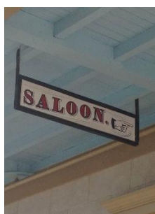
•Attached to building or canopy with metal straps