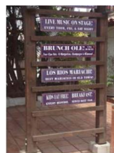
•Mounted on wood sign post(s)