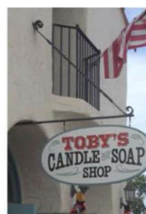
•Suspension from wrought iron