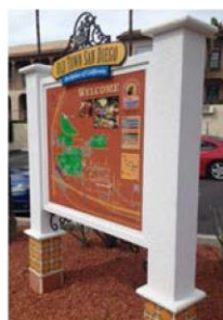
•Mounted on masonry column stucco finish