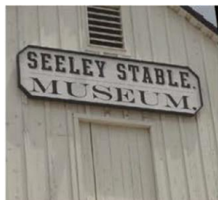
•Painted wood with