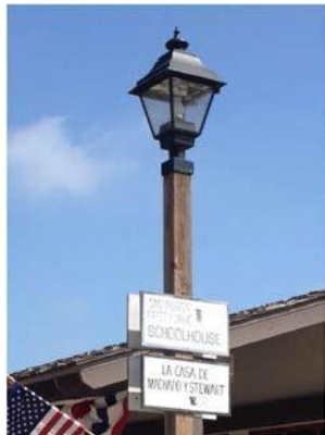
•French Quarter Lantern