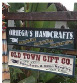
•Suspension from wood sign post